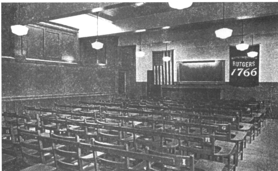
Classroom at the Rutgers University College of Pharmacy in Newark from the 1932-33 catalogue.

Withal, my interest in historical research was still very much alive. As an undergraduate I had twice won the Society of Colonial Wars Essay prize—a whopping big prize of $100, my master's thesis was on the government of the town of Newark from 1666 to 1836, and one of the courses I had taken at Columbia was in colo-